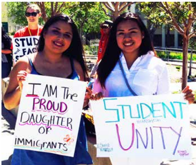
Cañada College students at the May Day rally

The action was a collaboration between the Cañada Dream Center and AFT. This is the first time that we have done this kind of action on May 1st, but it seems like it could be a great tradition.